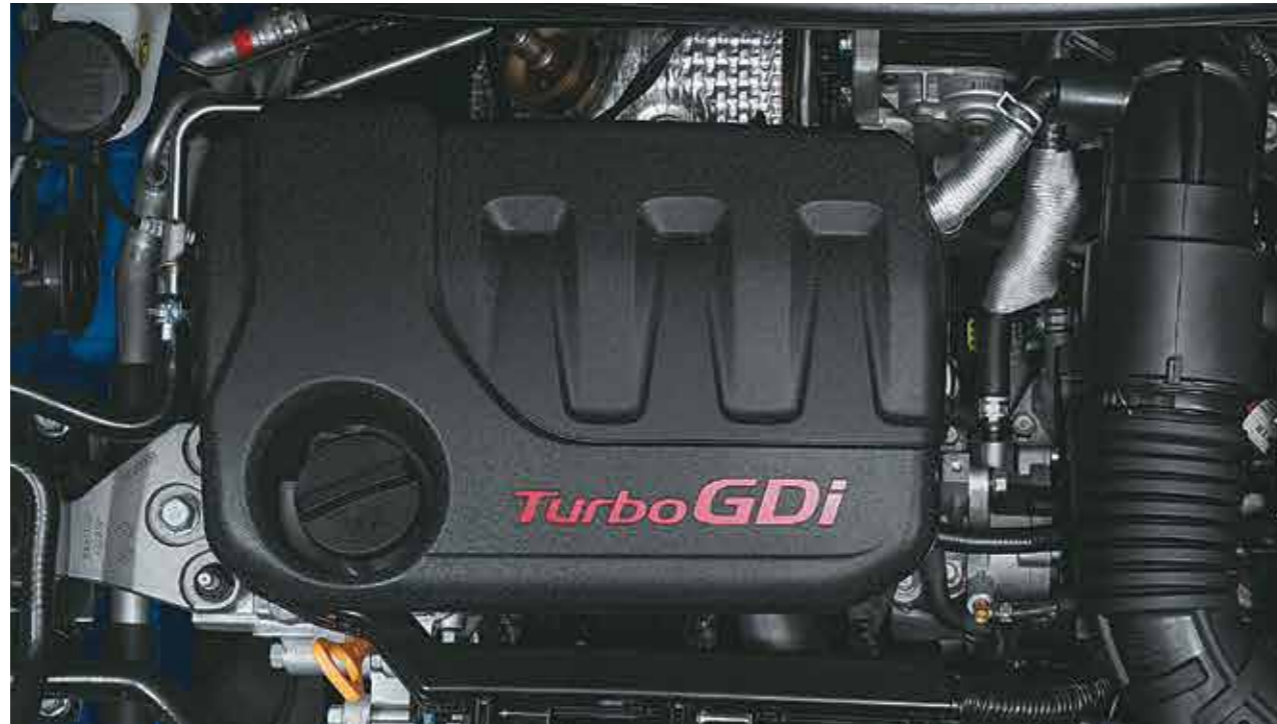
1.0 l Turbo GDi petrol engine with max. power of 88.3 kW (120 PS) / 6 000 r/min