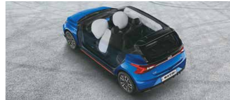
Driver, passenger, side & curtain airbags