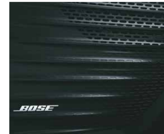
Bose premium 7 speaker system

Other features – Wireless charger with cooling pad | Digital cluster with TFT multi information display (MID)