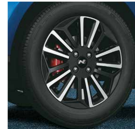
R16 (D=405.6mm) diamond cut alloy wheels with N logo and front disc brakes with red caliper