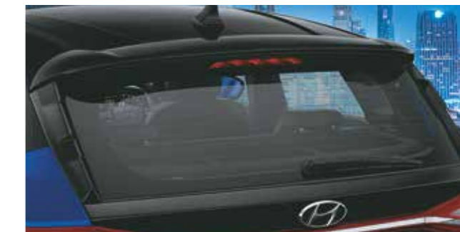
Sporty tailgate spoiler with side wings

Other features – LED projector headlamps with LED day time running lamps (DRL) | Dark chrome connecting tail lamp garnish Front fog lamp chrome garnish