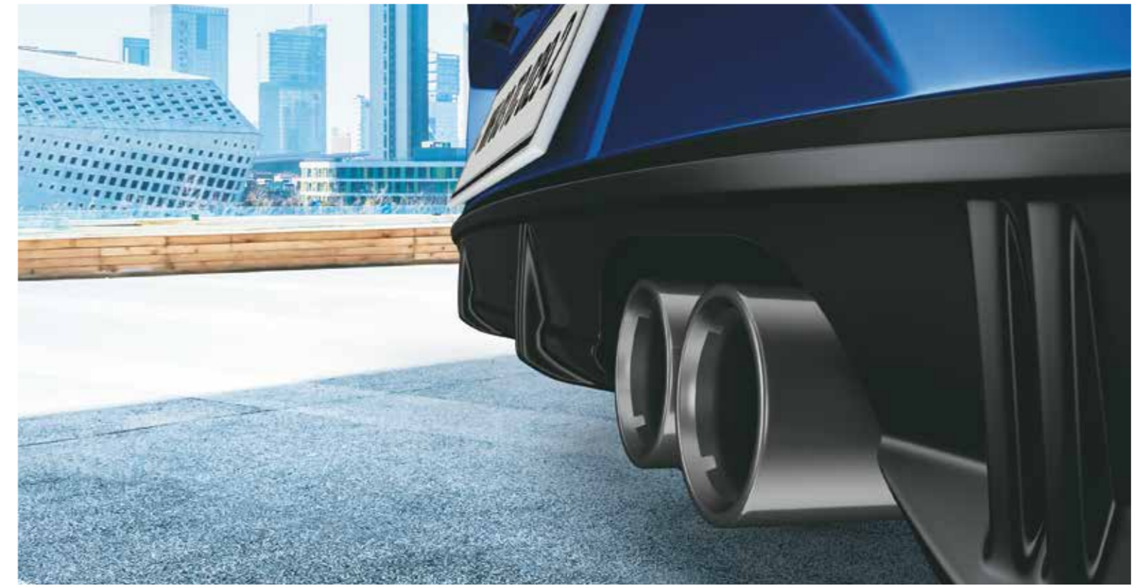
Twin tip muffler