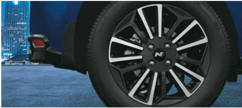
Rear disc brakes