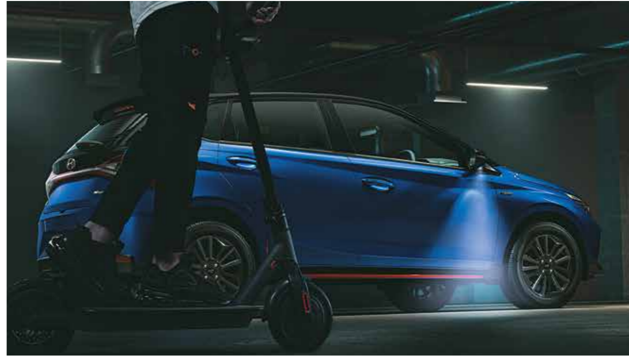
Puddle lamps with welcome function