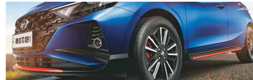
Athletic red highlights* (front skid plate & side sill garnish)

Sporty and breathtakingly stunning, the Hyundai i20 N Line commands attention everywhere it goes with its WRC inspired sporty new design. Its exciting new athletic design and playful details set you apart from the crowd in a field of lookalikes.