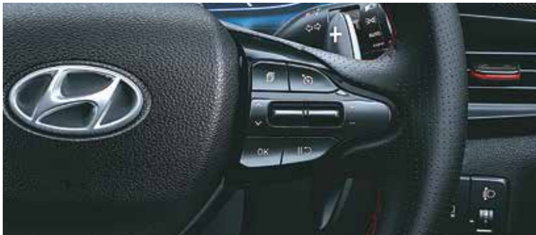
Paddle shifters (DCT only)