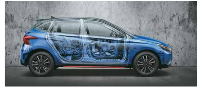
Strong body structure with AHSS & HSS