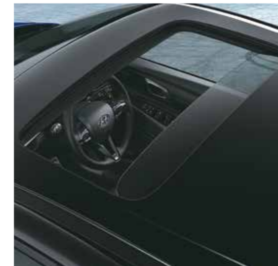
Voice enabled smart electric sunroof